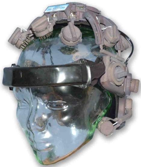
Figure 1 – Wearable Sensing’s DSI-24 EEG headset.