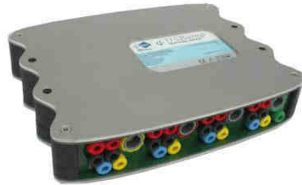
Figure 2 – gTec USBamp EEG amplifier.